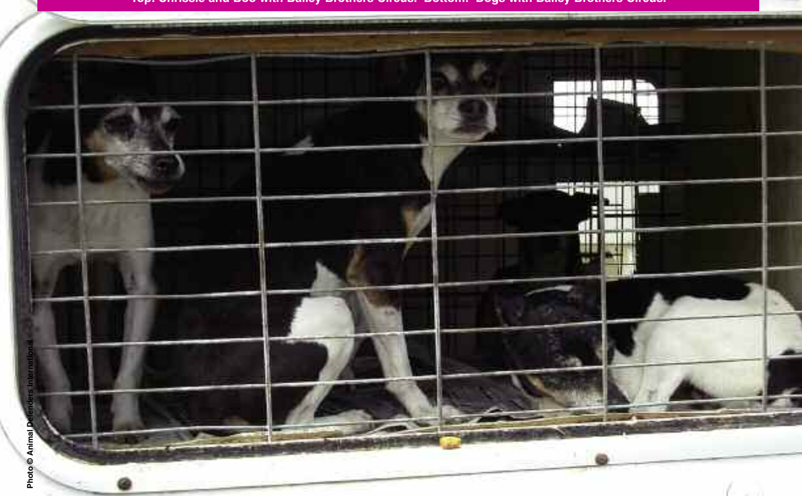
Top: Chrissie and Boo with Bailey Brothers Circus. Bottom: Dogs with Bailey Brothers Circus.