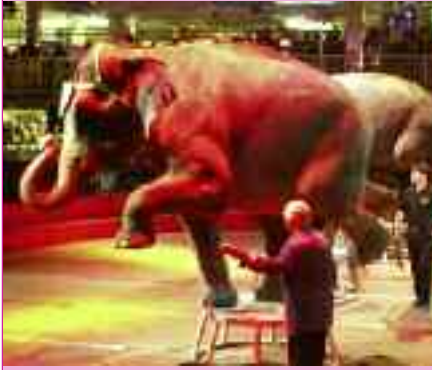
Hanneford Family Circus.

Circus animal acts do not teach respect for animals or appreciation of the other species who share our planet. In fact, they teach the opposite. Audiences are shown a caricature of an animal, often presented to make the trainer look strong and brave. While circuses strive for spectacle, animals are forced into increasingly bizarre and unnatural acts that they would naturally resist. So force is used to make them obey. Acts appearing in the U.S. during the study include tigers forced to jump through rings of fire, elephants doing front leg stands and a boxing kangaroo. Even domestic cats are pushed to their limit, leaping from a great height to land on a cushion.