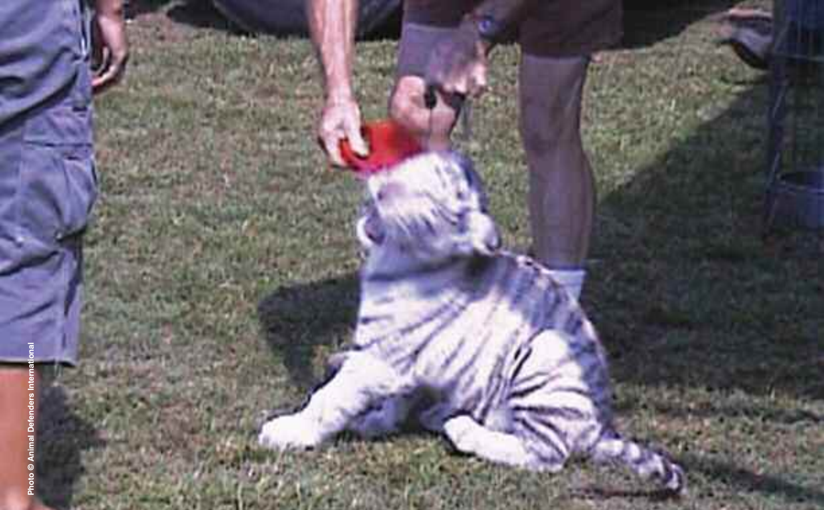
Top: Three month old tiger cub hit in the face, to “behave”, Sterling & Reid Circus. Bottom: Tigers in a trailer. Clyde Beatty Cole Brothers Circus.