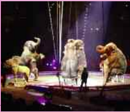
Ringling Brothers and Barnum & Bailey Circus.