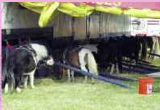
Animal Defenders International

Two ponies, Patches and Rebel, were often suspended from this work due to their aggressive behavior, such as bucking. One day, the pony ride attendant reported that the ponies didn't get enough rest, since they must work the carousel for five continuous hours. One pony had a swollen eye. Another kept trying to get down on her knees. A third had a breathing problem and was hyperventilating and gagging. Snowy had cuts and sores which were attracting flies so a circus worker used Clorox bleach on the open cuts.