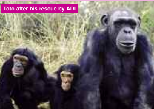
Toto after his rescue by ADI