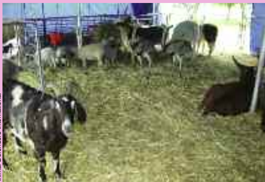
Animal Defenders International

Below right: Horses and ponies in circuses get basic stabling, but do not enjoy the benefits of access to pasture provided to equines in other commercial contexts.