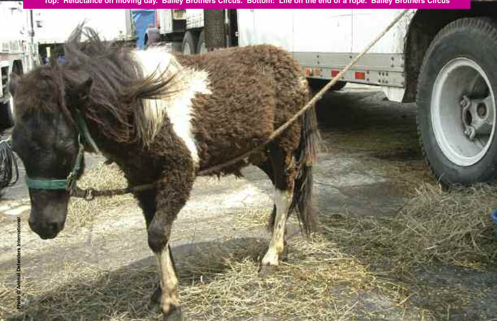
Top: Reluctance on moving day. Bailey Brothers Circus. Bottom: Life on the end of a rope. Bailey Brothers Circus