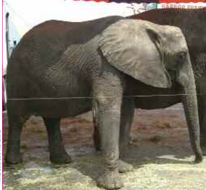
Animal Defenders International