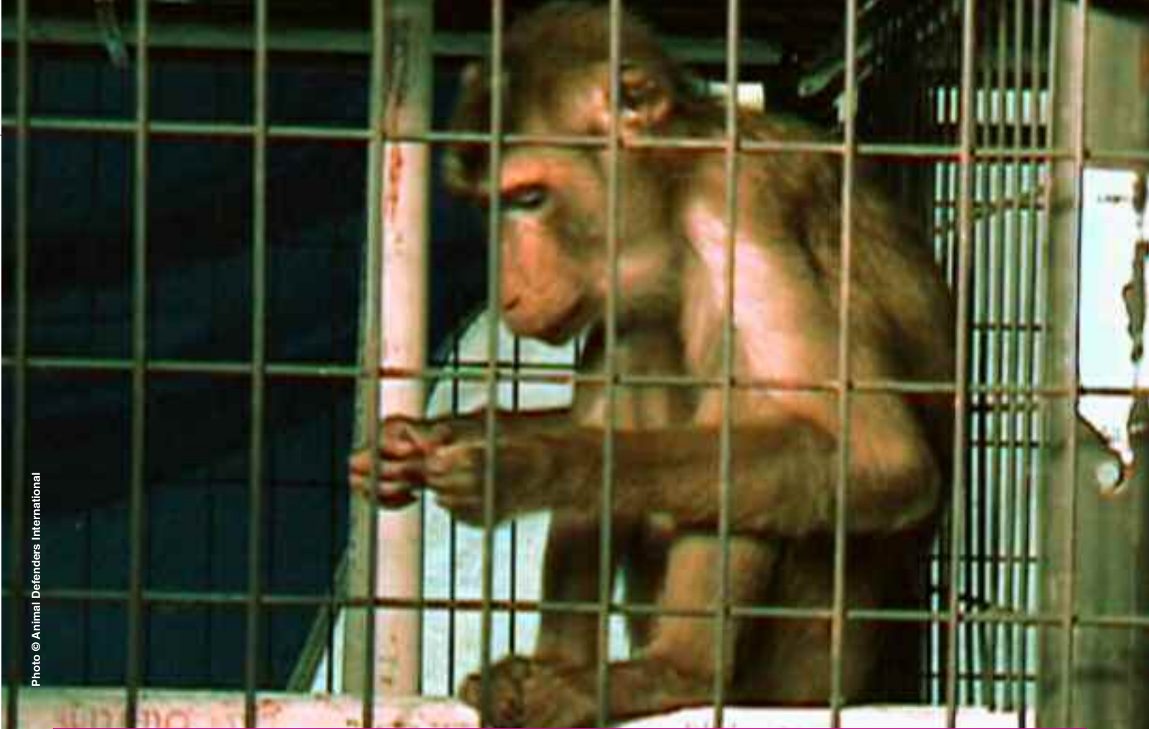
Top: Macaque monkey, Sterling & Reid Circus. Bottom: Hanneford Family Circus elephants enter indoor market.