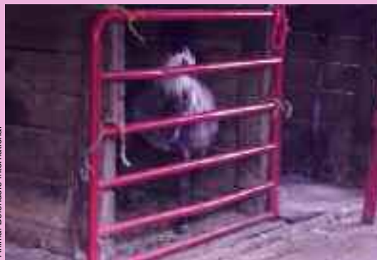
Animal Defenders International