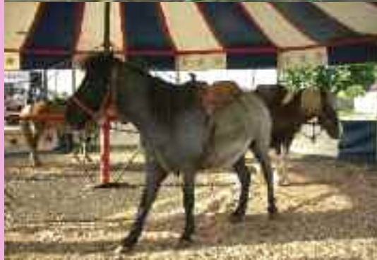
Animal Defenders International