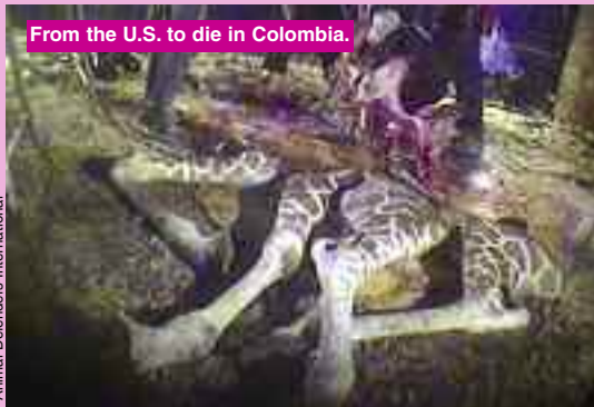
From the U.S. to die in Colombia.

Circuses and animal dealers export animals from the U.S. to appear in circuses around the globe. Animals imported from abroad are resold to circuses in other countries. America also buys and hires animals and acts from all over the world. It is time for the U.S. to help stop this animal traffic.