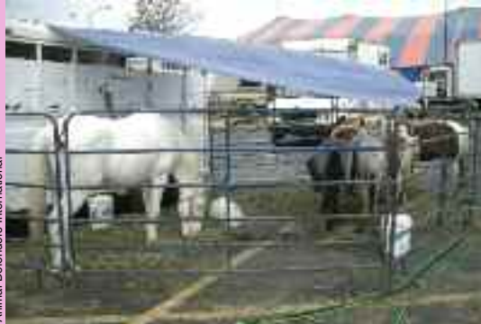
Animal Defenders International

Horses, ponies, camels, llamas and similar animals usually spend their days tied up by short ropes or kept in small stalls. We found that only rarely are these animals provided with exercise enclosures. Their only significant exercise is in the ring during rehearsals or performances. Time pressures, including cleaning stalls, watering, brushing and saddling animals up for shows, make it unlikely that these animals can ever enjoy quality free time and space.